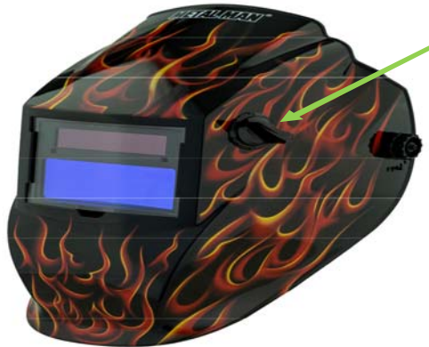
Shade Control 9-13 Plus Grind