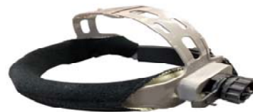
5 Point Adjustable Head Gear